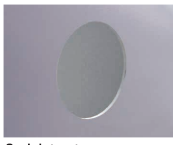
One hole to cut.