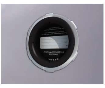
Single PIRma-Lock<sup>™</sup> ring nut.